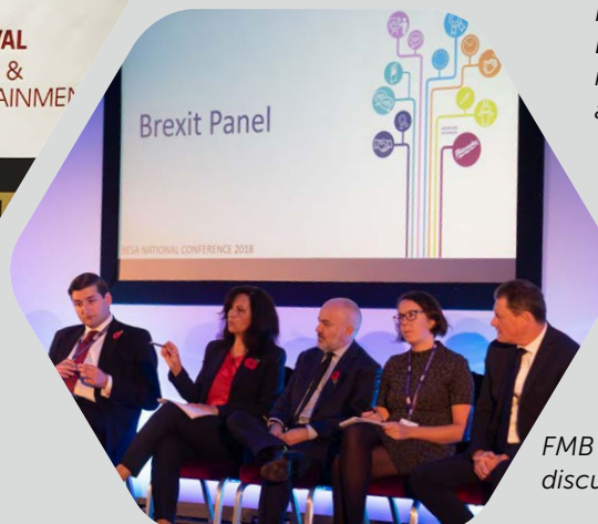
FMB Home Builders Group meet PM's advisors