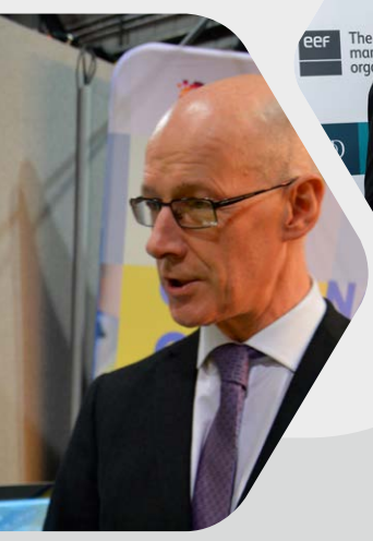
FMB Scotland meets John Swinney MSP