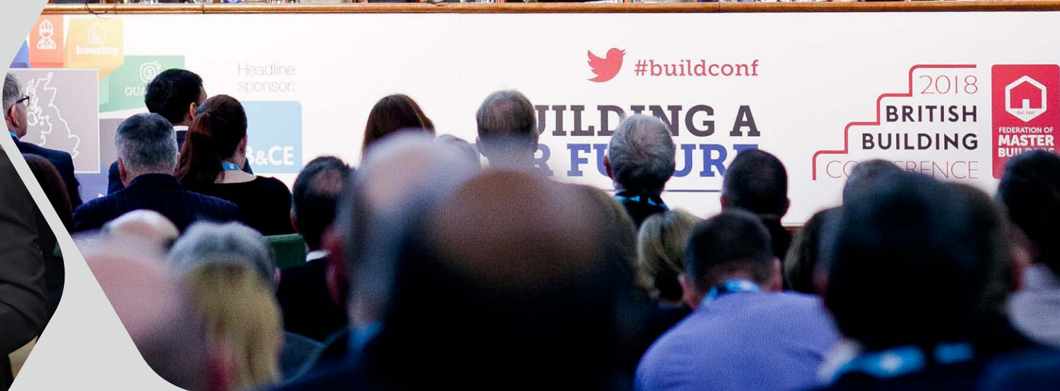
BBC Radio 4's Sarah Montague chairs British Building Conference