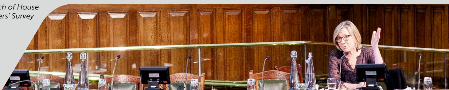
Launch of House Builders' Survey