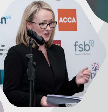
Shadow Business Secretary speaks at joint FMB Labour Party Conference