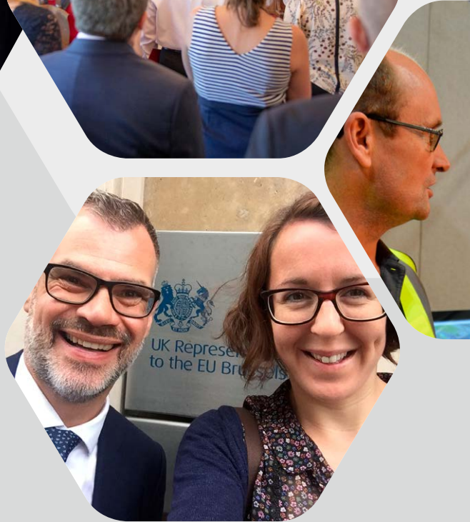
FMB visits Brussels for meetings with policy makers