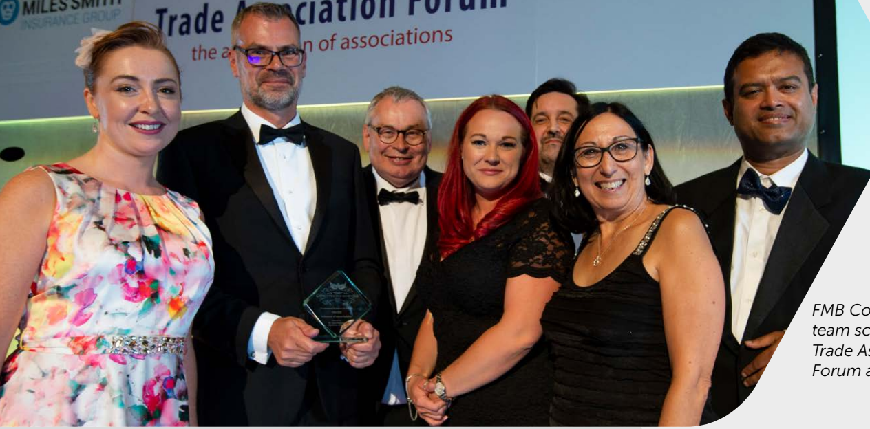
FMB Connections team scoops Trade Association Forum award