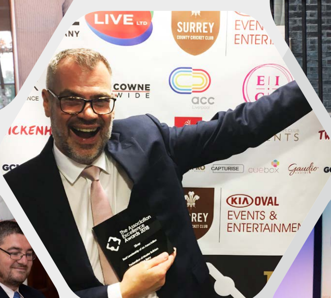
Chief Executive wins Association Excellence Leadership Award