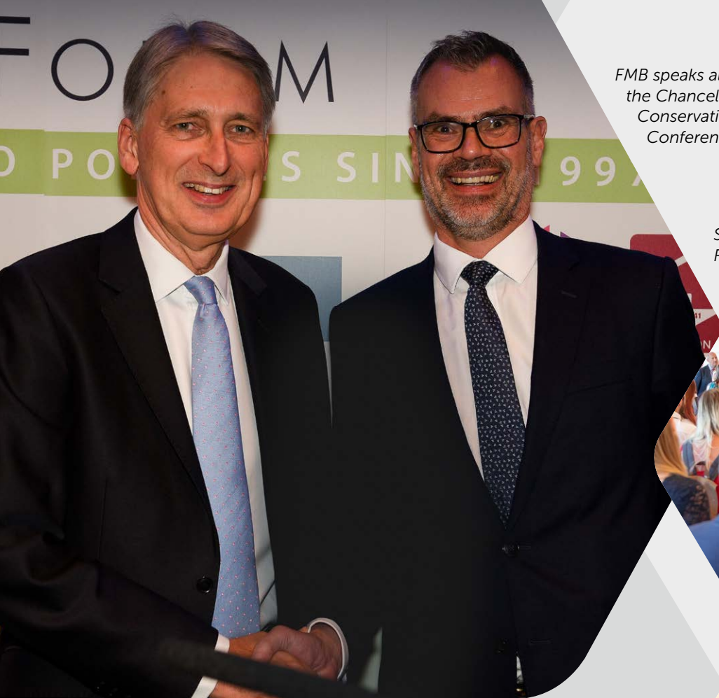
FMB speaks alongside the Chancellor at the Conservative Party Conference