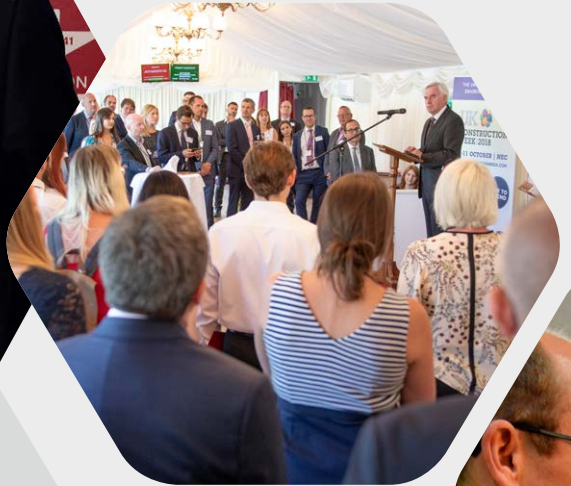
Shadow Chancellor addresses FMB 'Licence to build' report launch