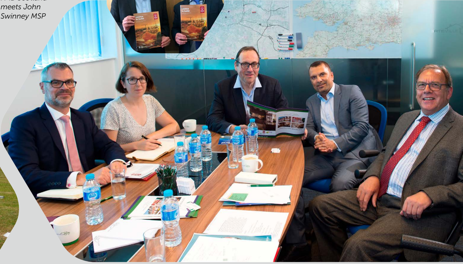
FMB organises meeting with Construction Minister and Master Builder firm Gateville