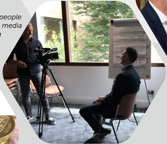
FMB spokespeople receive media training