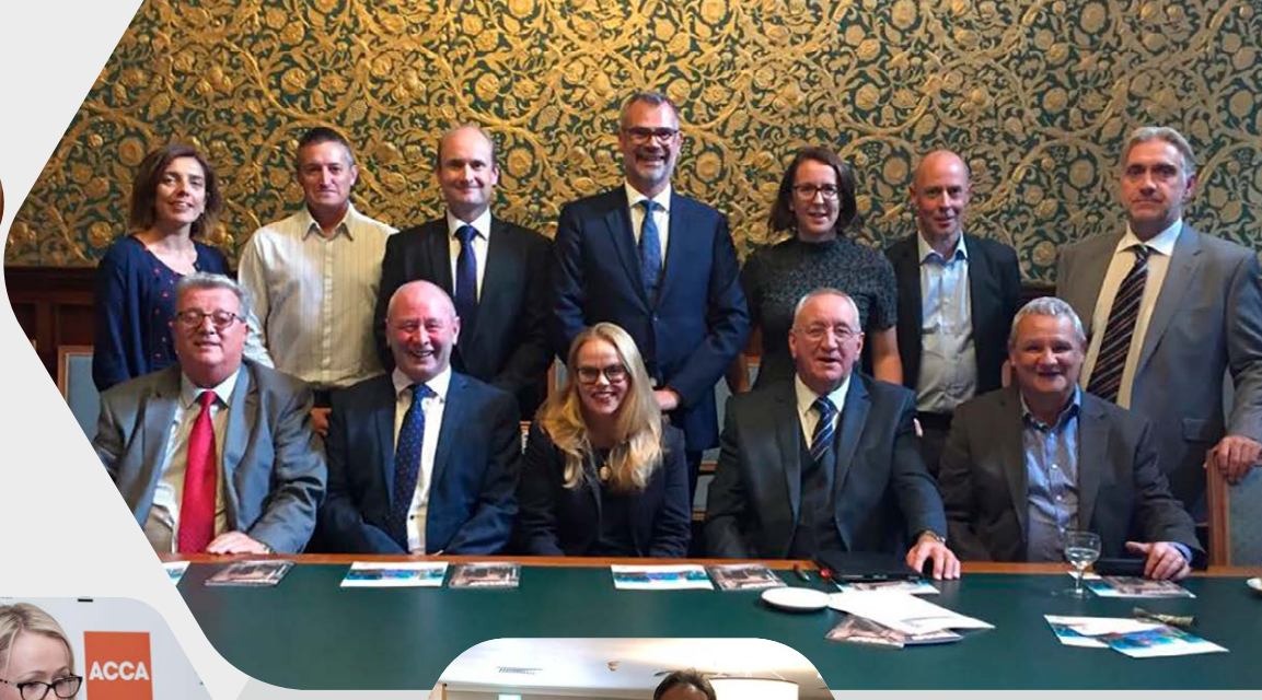
CEO of CITB meets FMB Scotland Board