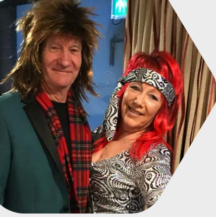
National President and his wife at the National Conference in their 70s finery