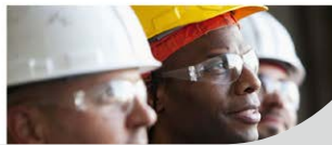
New independent licensing website developed by FMB