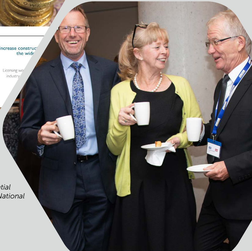
FMB Presidential Team at the National Conference